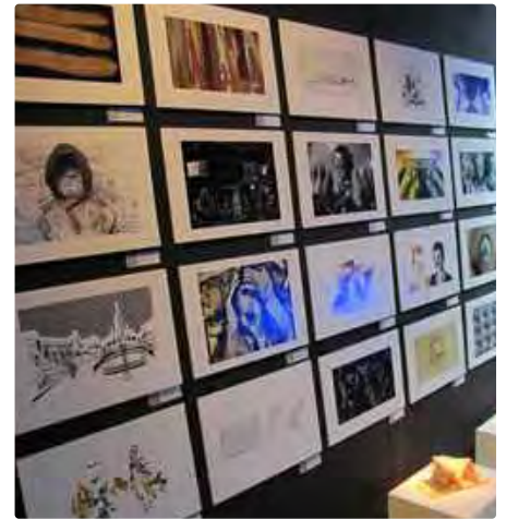
An array of art pieces featured at The Dark Horse Art Show on Friday, 6 Dec 2013.

She said the art show allowed the students to see, first-hand, how their efforts and creations were appreciated and accepted by the public, adding, "Being able to have our works displayed was in itself an experience. I'm glad everyone was able to share in it."