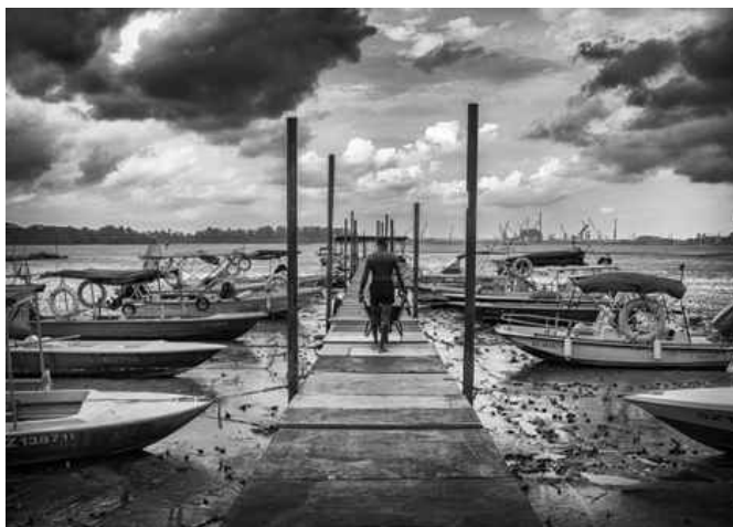
PANDORA WONG HUI SAN (Bronze in Photography)