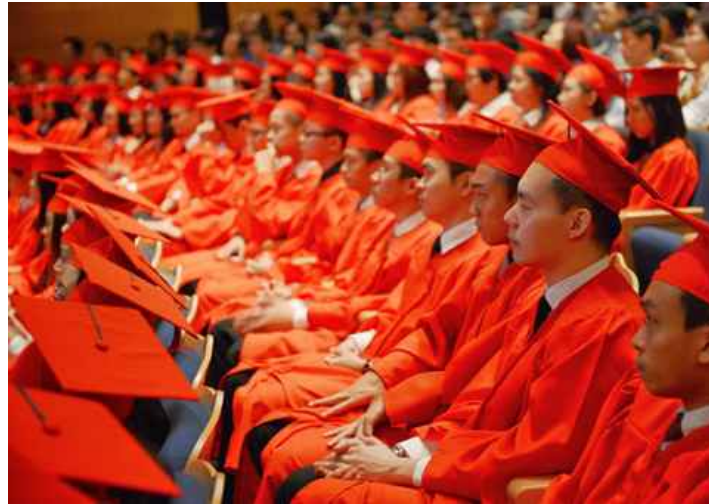
New UNLV graduates at the ceremony.