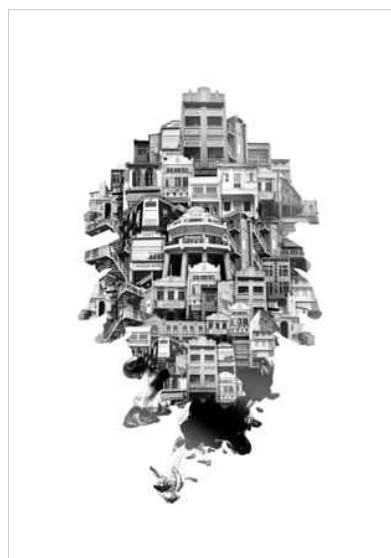
SARAH FONG SI YING (Bronze in Photography)