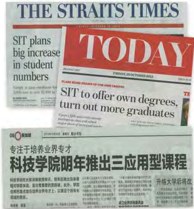
News of SIT introducing its own degrees made it to major newspapers.

SIT will pilot its Integrated Work Study Programme (IWSP) through its new applied degrees. To be held over a span of 8 to 12 months, the IWSP is a unique blend of full-time work and study where students will be able to gain real work experience through the course of their studies and apply classroom learning in their immediate work environments. The structure of each IWSP will be unique to its degree programme. Typically however, they will be of a longer duration than other internships so as to cater to different industry needs and allow a fuller learning stint.