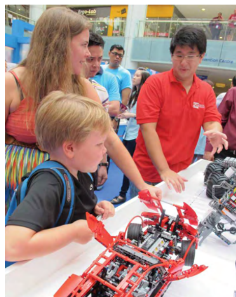
Sparking the fire of scientific inquiry in a young fan.

Now in its 10th year, the Singapore Science Festival 2013 was held on 19 July at the Central Atrium in Marina Square in conjunction with X-periment, a 3 day weekend carnival. Having close to 70 events, activities and exhibitions featuring international experts and science performers, the festival's mission was to take science out of the laboratories, and to showcase to the public recent technological advances which have contributed to Singapore's economy and society.