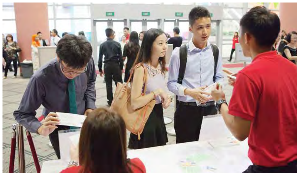
Students arrive early to register for the Welcome Ceremony

What a great way to start off a new chapter in life!