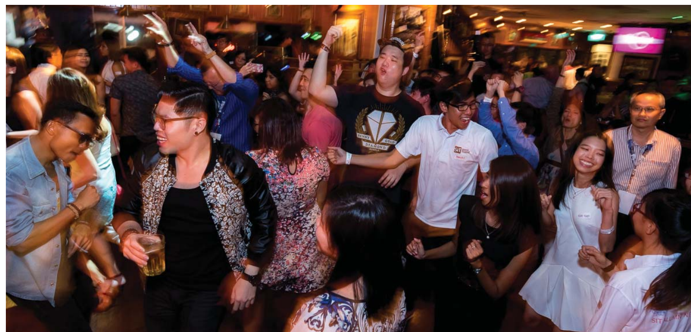
Jive Talkin' brought the house to its feet.