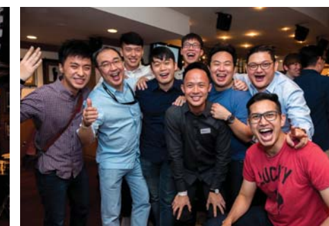
What a night!