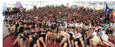
Biggest orientation camp at SIT to date with 925 participants was managed by 150 student organisers and facilitators.

The queues outside Buona Vista MRT station started as early as 8.30 am on 20 August 2015. In line were hundreds of newly matriculated students from the Singapore Institute of Technology (SIT) waiting for shuttle buses to take them to the SIT@Dover campus for the August SIT Student Orientation Camp 2015. The camp, a three-day-two-night affair that took place from 20 to 22 August 2015, was attended by 925 incoming first-year students.