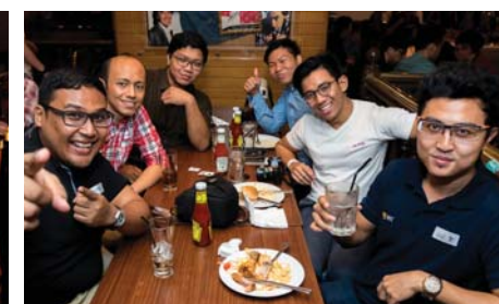
A quiet moment to catch up over a sumptuous spread before the partying began.