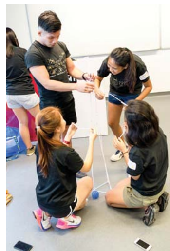
SITizens who learn together also build together.