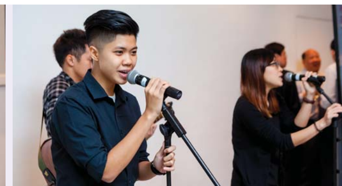
The student band, Muzeka, entertained the guests with popular hits.