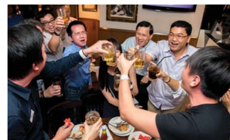
Faculty members offer a toast, the first of many during the night, to the Class of 2015.