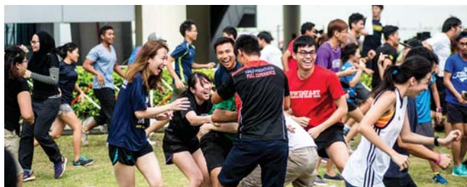
New SITizens try to avoid getting wet during a water bomb fight that took place at the SIT@Dover campus.