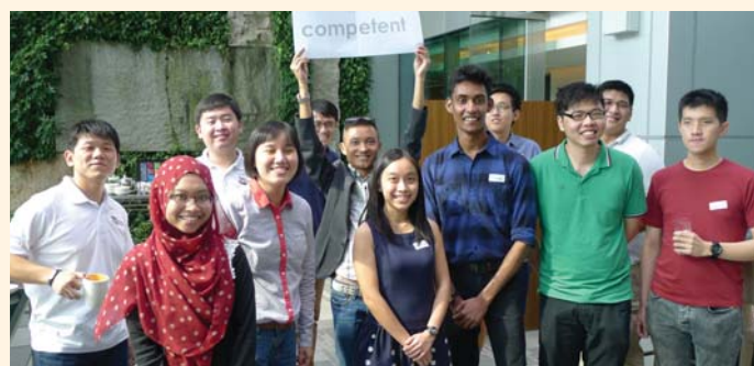
Alumni participants pick a side that best describe them for one of the activities.

"I'm trying to let my real personality shine through again, so that I can grow and improve both personally and professionally," she said. "I'm definitely looking forward to more personality workshops in the future."