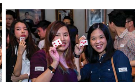
"We're not a pair!" Alumni went looking for their other halves during a stage game.