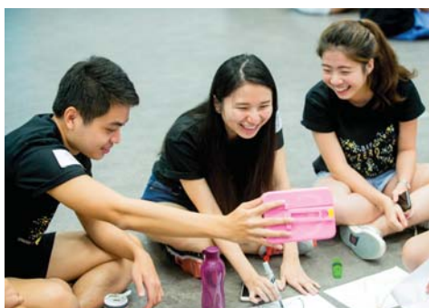
Looking for the woman in the mirror.