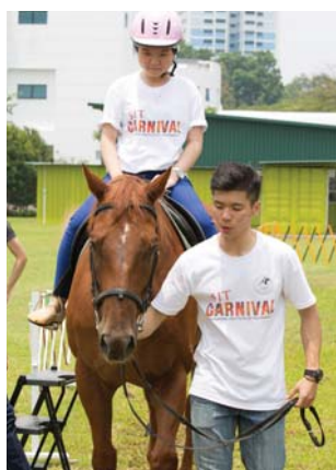
The SIT Saddlers Club led horse rides to anyone who was willing to stand in line for the hour-long wait.

In addition to the food and game booths showcasing the SIT-DNA, there were also workshops and talks held throughout the day. The sports groups held different activities including climbing sessions in the bouldering room by the SIT Climbers, and even horse riding by the SIT Saddlers Club.