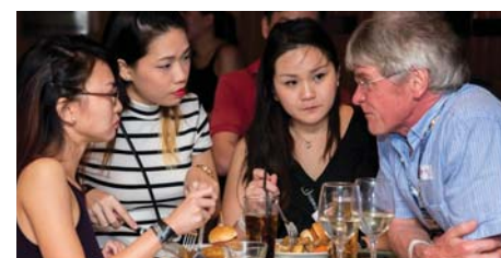
What looks to be serious conversation for a party.