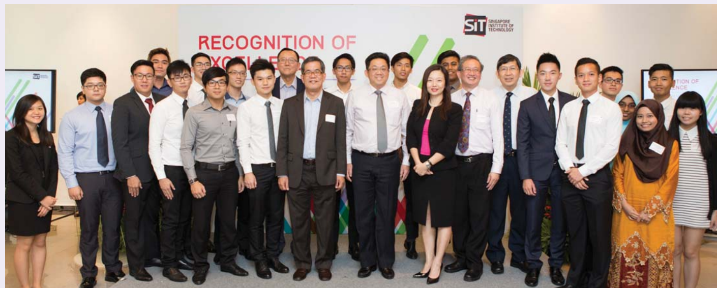
Recognising excellence – the award winners with SIT Senior Management and members of SIT's Board of Trustees after the event.

First-ever event brings together talented SITizens and generous donors, in an intimate celebration of student achievement and thoughtful philanthropy to support excellence awards at SIT