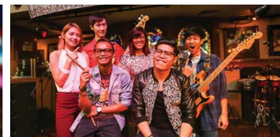
Presenting...the talented members of Muzeka.