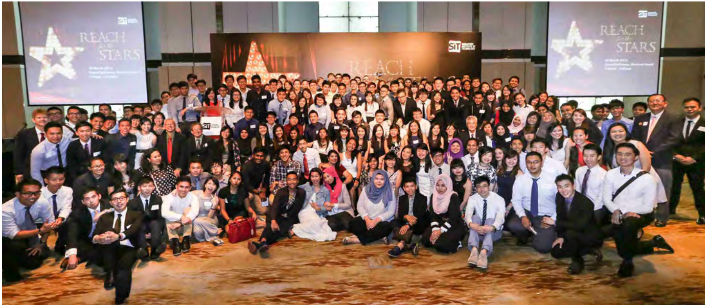
Some of the brightest minds at SIT.

Annual Reach for the Stars event celebrates achievements of scholars at SIT, as well as industry partners who support SIT students through sponsorships and bonded scholarships