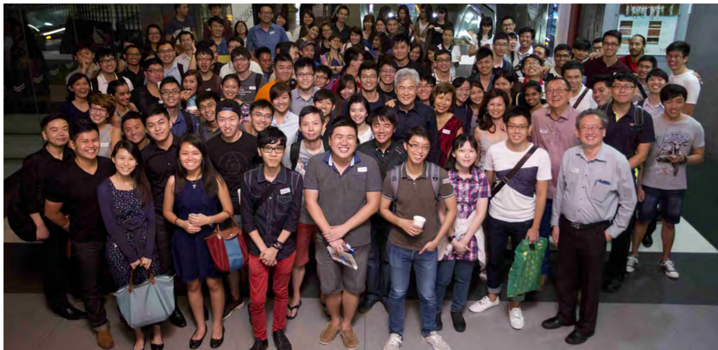
A shot to be remembered, starring SITizens!

Screening of Avengers: Age of Ultron is most popular SIT Alumni Movie Night ever