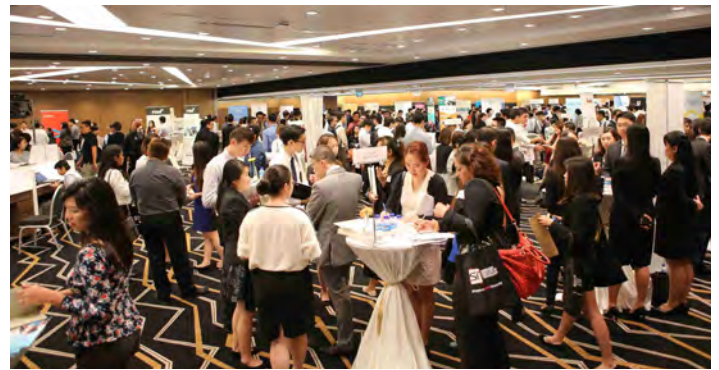
Top: The main exhibition area was abuzz with activity with students taking the opportunity to find out more about the jobs that were available. Right: Taking their futures seriously – these students were interested in what a potential employer had to offer.