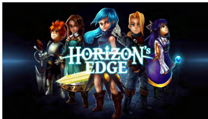
Top: A poster for Horizon's Edge. The studio posts updates on their Facebook page at:

He added, "So far, working for yourself is not something that is immediately rewarding. We get a sense of self-fulfilment whenever we complete a milestone. It's not true that money is what drives us, but it's also not true that we work fuelled solely by our passions. It's more a balance of both, and we are able to gauge what our priorities are."