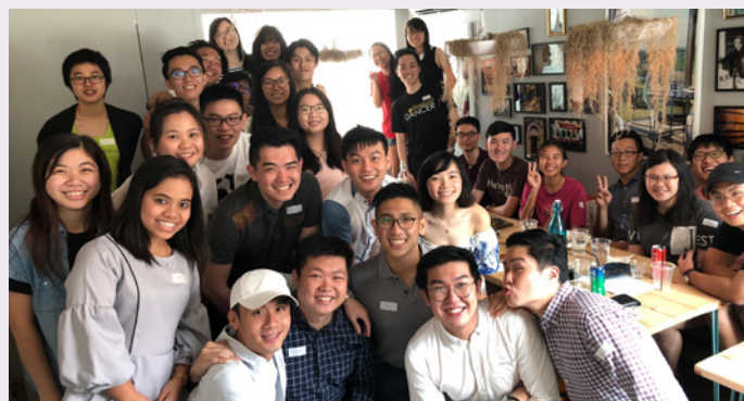
Big smiles after a filling and satisfying meal!