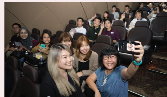
Time for a quick selfie before catching the adventures of the King of Wakanda.