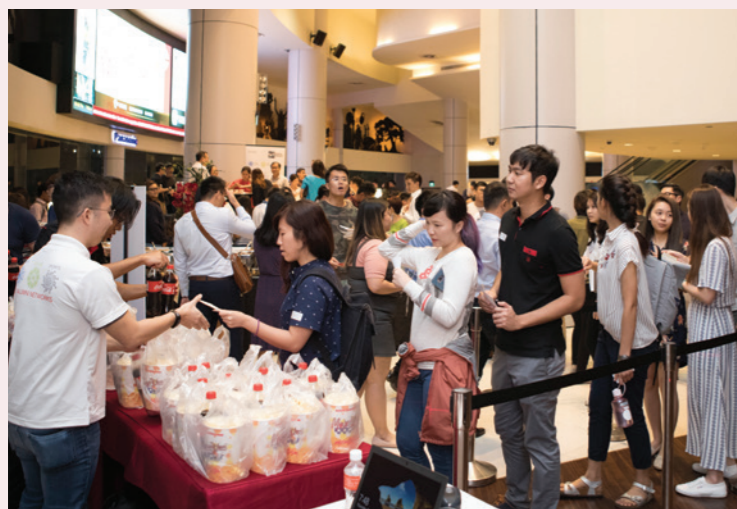
Popcorn and soda are must-haves when you're watching a movie.