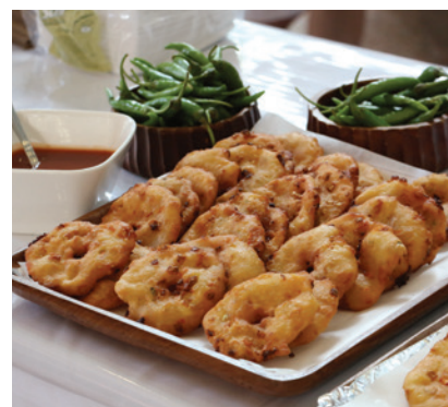
Snacks for tea time: freshly cooked vadai served with green chillies, as well as doughnuts and coffee.