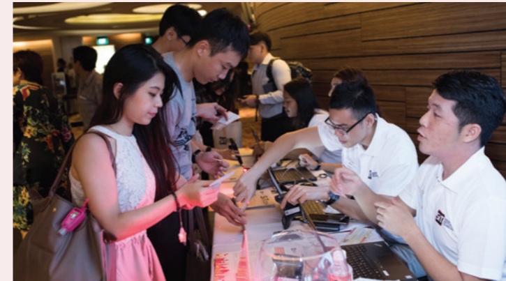
SITizens collecting their tickets for the movie with the help of our friendly student hosts.