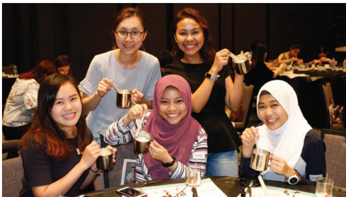
Getting ready to melt the soy wax after arranging their decorations!