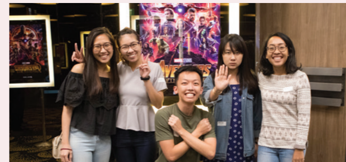
Armed and ready for Infinity War!