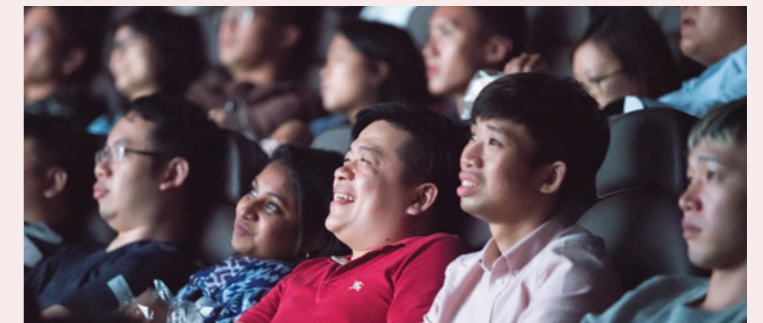
A mixture of emotions as alumni follow the adventures of the Avengers on-screen.