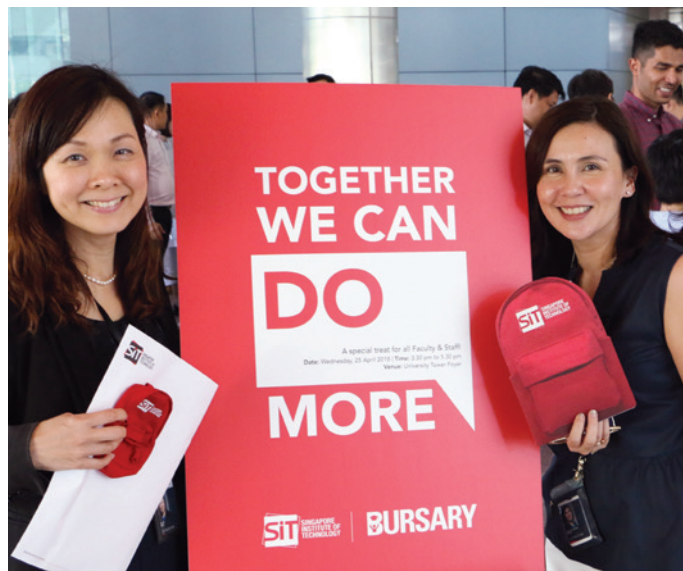
At this year's Faculty & Staff Giving Roadshow, donors received a small token for their big-hearted support of SIT students: a tiny pouch shaped like a mini-backpack.

In appreciation for their support, the fifth Faculty & Staff Giving Roadshow was organised on 25 April 2018 at SIT@Dover campus. Participants were treated to doughnuts, coffee and freshly fried vadai with green chillies.