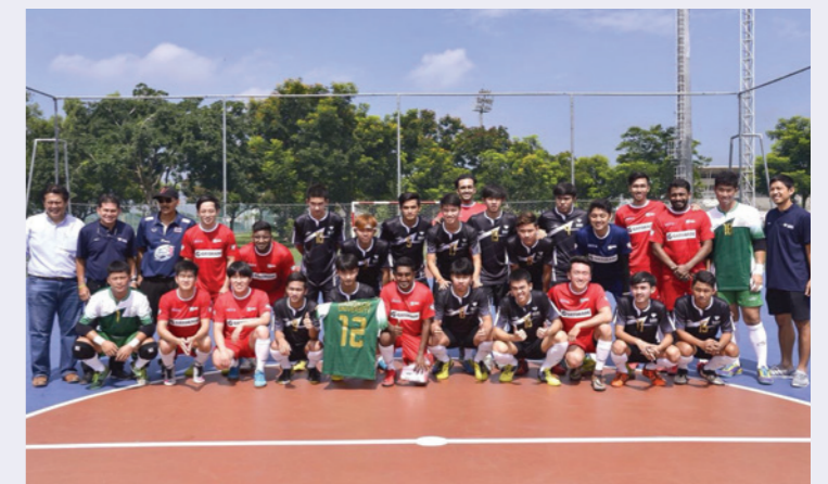
SIT alumni futsal players, decked out in red with the team from Bangkok University.