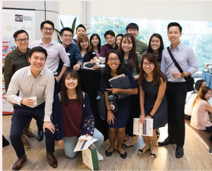
Friends gathered together for a fun movie night out!

With the release of two of the most anticipated superhero movies of the year, fans of the Marvel Cinematic Universe were in for a treat at the two SIT Alumni Movie Nights held this year. A signature event by the SIT Alumni Leisure Network, the screenings were held on 22 February and 10 May 2018, featuring Black Panther and Avengers: Infinity War respectively. This year, the events were held at a new and bigger venue at Shaw Lido to accommodate the growing audiences.