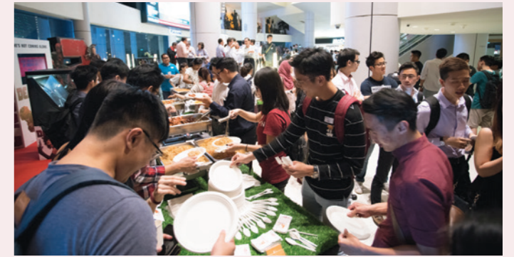
Hungry alumni fuelling up at the buffet reception before the movie.