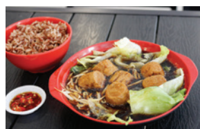
Quorn™ is sold in a variety of forms such as meatballs (in photo), nuggets, meat-free mince and even “sausage” patties!

Xin Hui, who is currently in the fifth month of her IWSP internship, says, “We hope to spread awareness among students about this whole new category of food that is up and coming in Asian markets, as well as give our vegetarian fellow students more options to choose from at our canteen!”