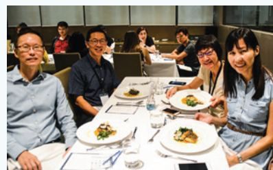
Happy guests can’t wait to dig in to their main course of barramundi with fregola, charred broccolini and clams.

“It is heart-warming to be able to give back to society with our passion.”