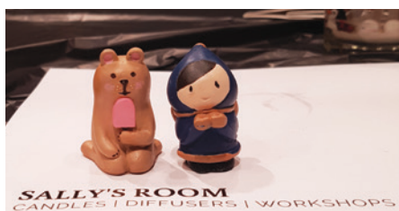
Completed clay ornaments made from moulds and meticulously painted by the alumni.