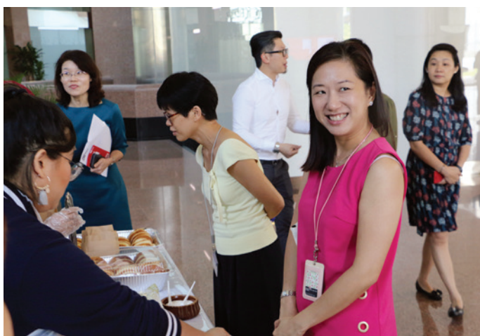
Attendees happily queuing up for their snacks and coffee.