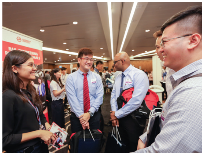
Visitors to Career Nexus were able to engage with representatives from established organisations such as SMRT.

At the IWSP Preview, students reading the SIT-Newcastle University (SIT-NU) joint degree programmes had the chance to network with SIT's industry partners. This allowed them to make more informed choices for their Integrated Work Study Programme (IWSP) applications and get to know prospective employers such as Keppel Offshore & Marine, 3M Asia Pacific and Philips Electronics Singapore.