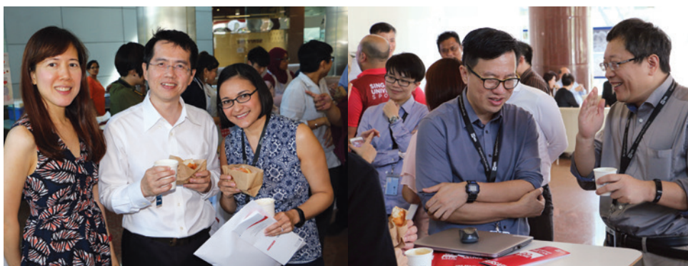
SIT faculty and staff came down to University Tower to show their support and enjoy a quick tea break before heading back to work.