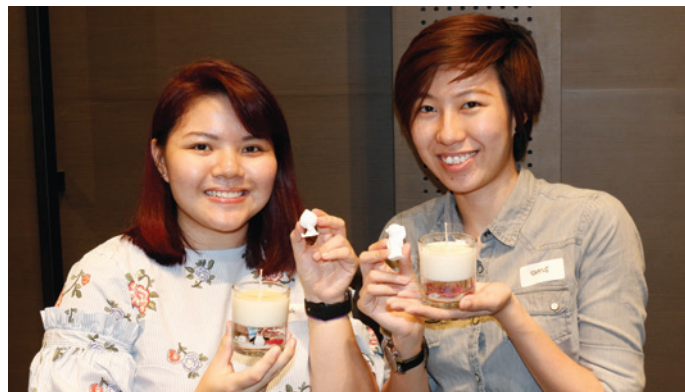
Happy SITizens with their completed candles and clay ornaments.