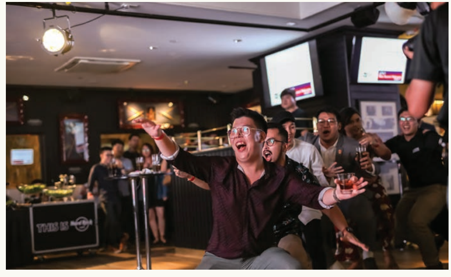
Alumni losing no time in joining in the party train, complete with beverages in hand.