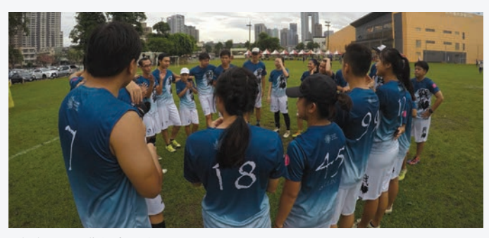
A little pep talk before their games.