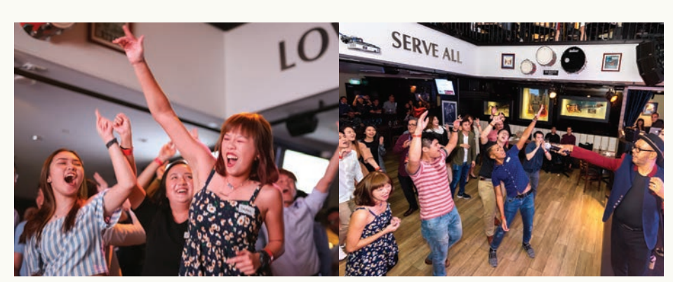
Jive Talking, Hard Rock Café's resident band, brought the crowd to their feet early in their night with their covers