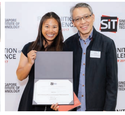
Engineering Scholarship is a "golden opportunity." possible.