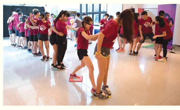
Steady now – freshmen learn to listen to each other and work with their team mates, while blindfolded.

A highlight of the camp was the "Legacy Celebration" on the second day, where the four empires (Hydra, Gryphon, Phoenix and Pegasus) showed off their talents with a performance and their empire cheer. Pegasus ended up clinching their first-ever best Empire award.