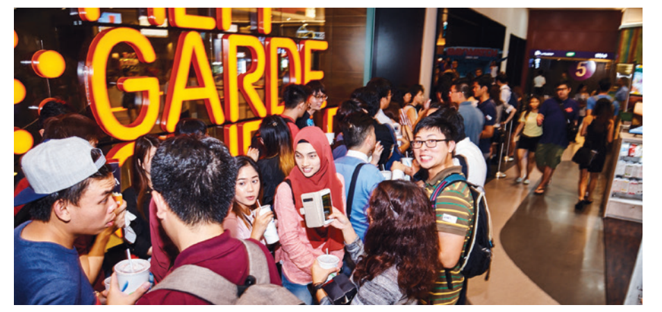
Ample time to bond as they queue to enter the cinema hall.