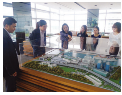
The visitors from SIT also toured Mapletree Investments corporate headquarters.