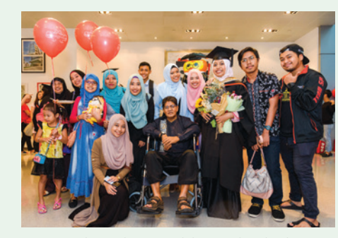
Some made it a bigger celebration by also bringing along friends, relatives as well as family members.

Bachelor of Accountancy with Honours Singapore Institute of Technology