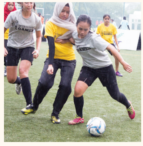
They kept on dribbling even while it was drizzling.