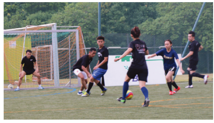
She is in an excellent position to score and her opponents know it.