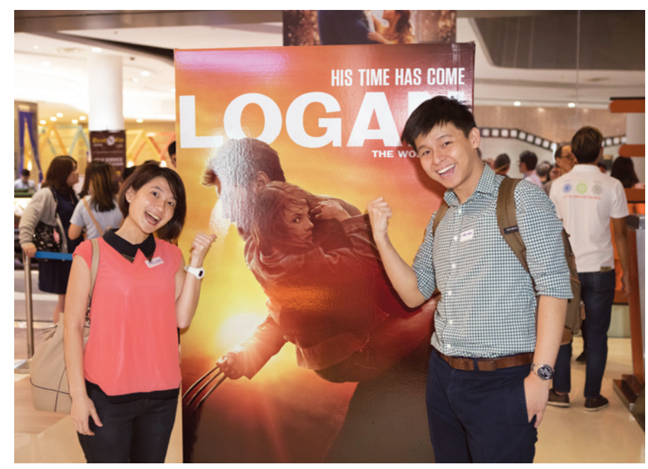
Alumni Movie Nights are just too good to miss.