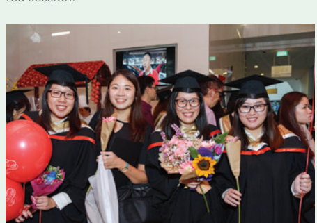
All ready to make their mark in the corporate world.