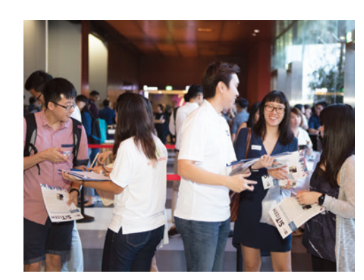
Friendly student hosts ever ready to keep alumni up to date on the latest happenings.