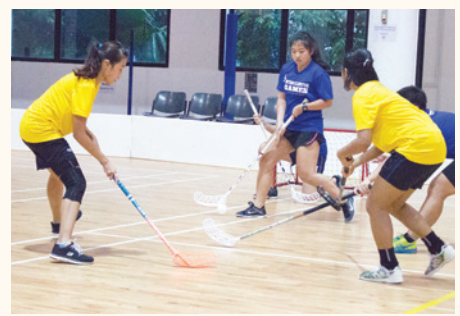
Non-stop action kept the floorball players on their toes.