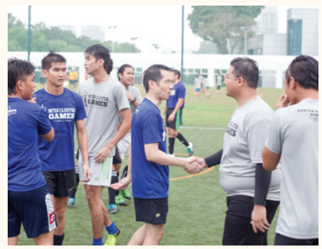
After a fiercely fought game, handshakes to thank each other for a good match.