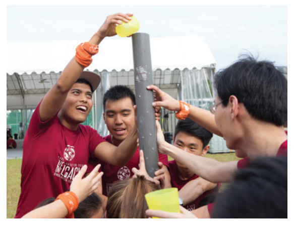
Helping each other out, one drop at a time.