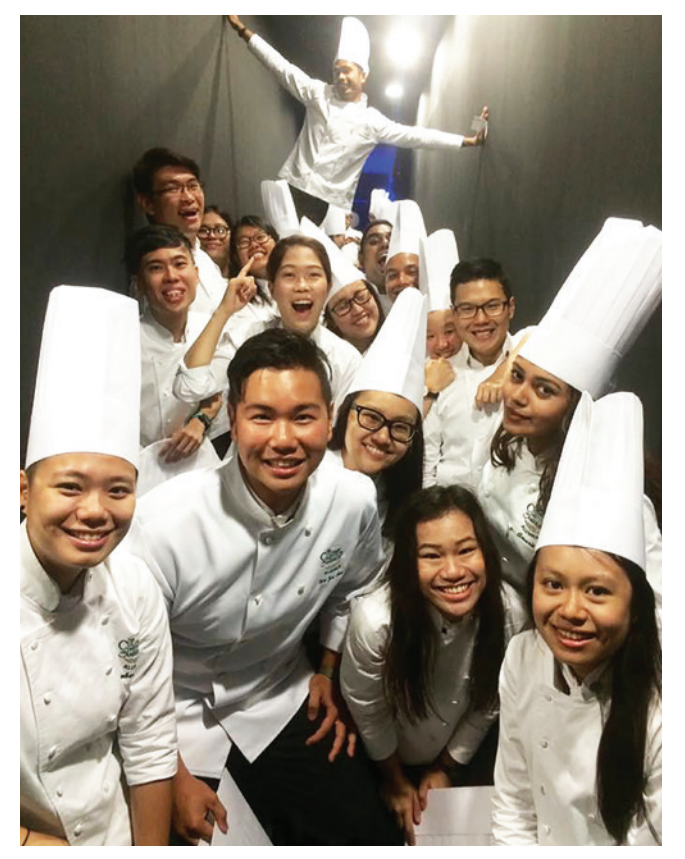
CIA's new graduates are eager to cook up a storm.

Armed with their new degrees, SITizens are eager to make their mark in the world