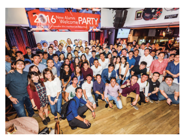
This crowd couldn't wait to start partying. See what they got up to inside...

Hopefully the Class of 2016 will have much to look forward to as they venture into the working world. SIT graduates are sought after as shown by the encouraging results from the latest Joint Graduate Employment Survey. Around nine in 10 new SIT graduates surveyed had found employment after graduation. More significantly, 83% had secured full-time permanent employment within six months after completing their final examinations. They were also earning higher starting salaries with the median gross monthly salary at $3,055 in 2015, up from $3,000 the previous year.