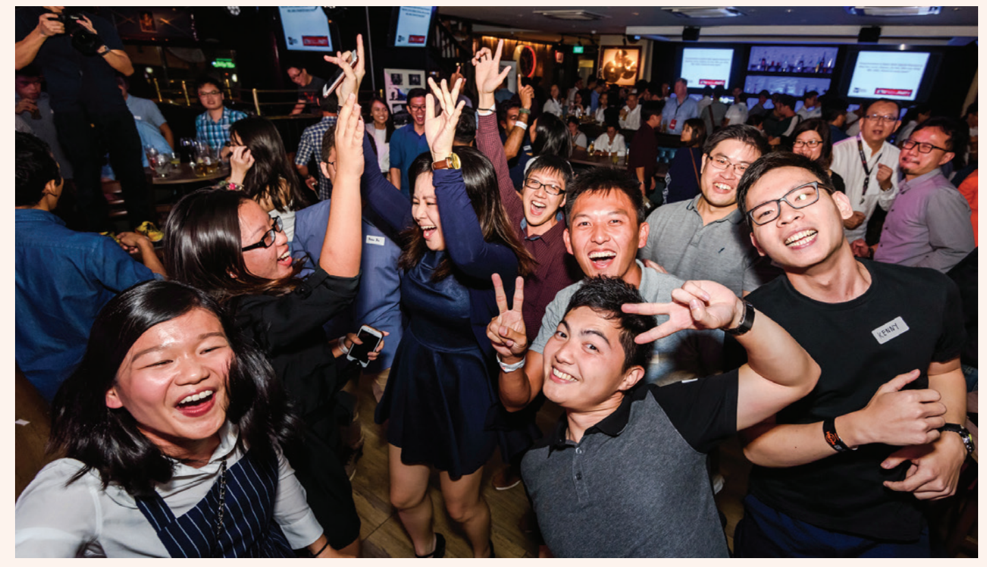
The music was so mesmerising that it got these alumni on their feet and on the dance floor.

SITizens make merry at 2016 New Alumni Welcome Party