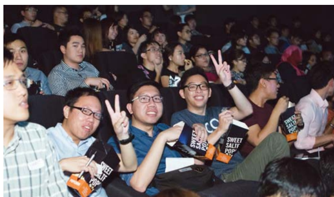
Alumni also got to watch a short clip with some familiar faces on the big screen – a video of all the latest happenings at the SIT Alumni Network events!