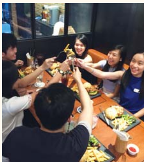
One for all, and all for one!

facilitator for Sweet Creations held in June 2015, and will also lead a second workshop on 18 June 2016.