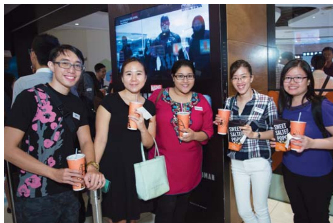
"We're Team Cap!": These folks were the first in the queue to get the best seats in the theatre.