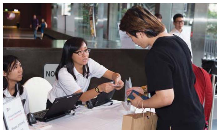
Friendly student hosts handed out tickets and the popcorn and drink coupons at the registration booth