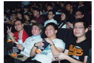
Alumni settling in with their popcorn and drinks, right before the movie.