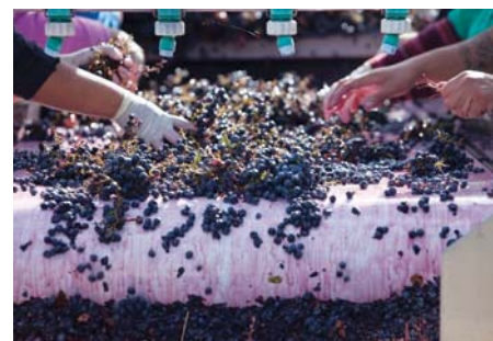
The grape sorting table at the estate, where workers remove leaves, twigs and non-usable grapes.