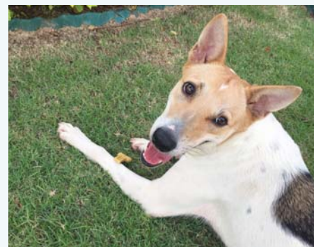
Xiaobai in her natural habitat at the SIT@Dover campus.

If you would like to help foster this gentle canine, get in touch with us at Alumni@SingaporeTech.edu.sg