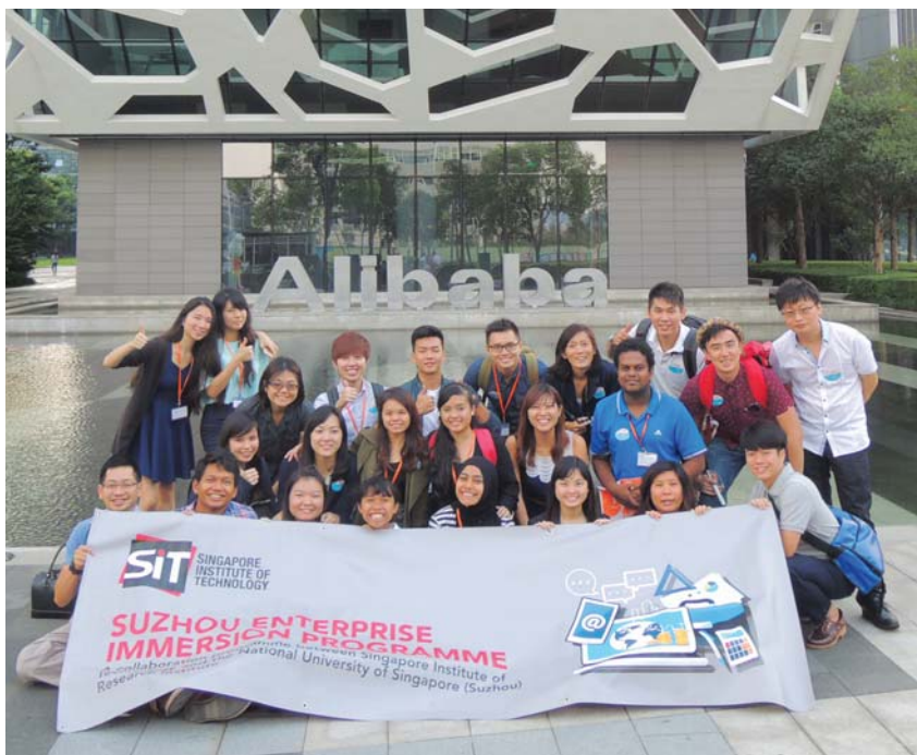
The EIP took these SITizens to Suzhou in August 2015. Beijing is another EIP location and there are plans for students to visit Japan.