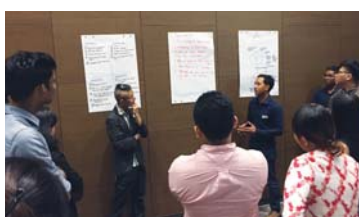
Participants at the workshop also presented their observations to the rest of the attendees.

This is the second in the series of Personality Application workshops that the SIT Alumni Career Network has organised. Previously, the Network organised the Basic Personality Workshop, an activity-based foundational workshop that was held twice, once in September 2015 and subsequently in December 2015.