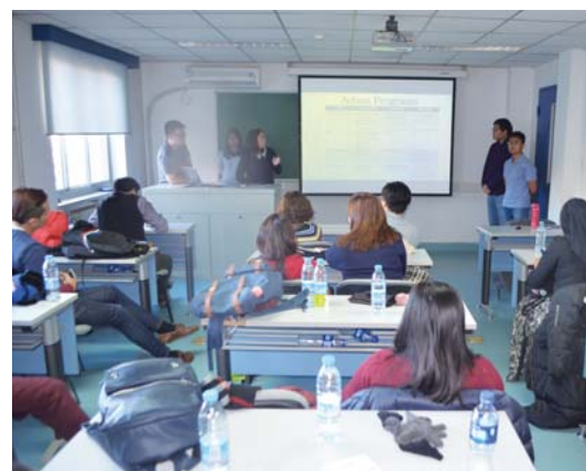
At the end of each trip, EIP participants will have to present their business plan to the trainers, where they receive immediate feedback on their ideas.

She added, "I definitely benefited from the whole experience of the trip and the learning journey beyond the classroom was amazing. I believe this is one of the greatest takeaways during my journey at SIT."