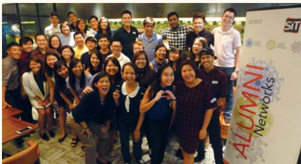
Everyone's full and happy after the three-course dinner!