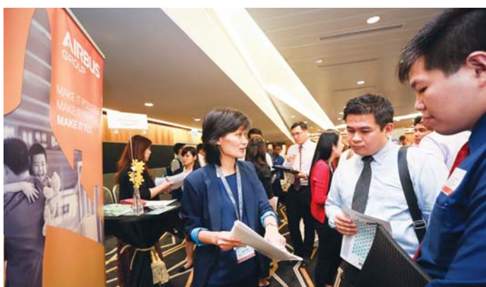
Career Nexus 2016 provides a platform for graduating students to scope out available job opportunities.

At the Career Nexus 2016, SITizens begin their job search, networking with big names in the industry even before graduation