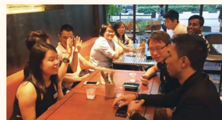
Catching up with friends before the dinner began...