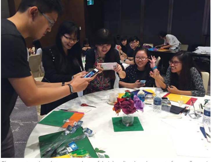
Phones out, and ready to snap a photo of their handiwork – a bouquet of paper flowers!

SITizens learn how to make paper gifts for their Valentine at a fun-filled Origami Workshop organised by the SIT Alumni Leisure Network