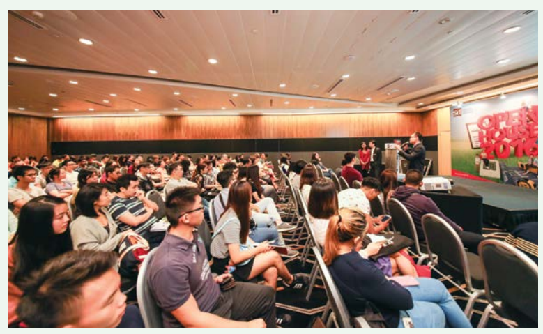
Close to 500 people attended Information Talks on the Allied Health programmes at the SIT Open House 2016.