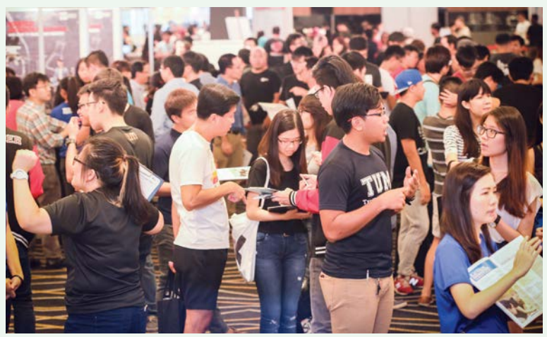
Visitors throng the main exhibition area.

The SIT Open House, a yearly affair, offers potential students a glimpse of life at SIT, from its unique applied degree programmes to the vibrant student life on campus