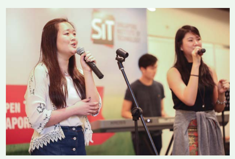
Martial arts displays and musical performances were put up by SIT students in the main exhibition area.

He added, "The main reason why I would choose to come to SIT is that it offers more industry based learning and more of a hands-on experience which is suited to my way of studying."