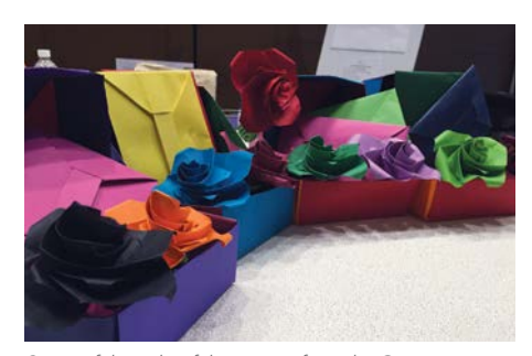
Some of the colourful creations from the Origami Workshop.